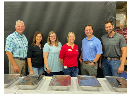
Friendly Faces at GO Club Picnic 2024

Call 417-256-2147 or email cheryl.finley@westplainsbank.com to make your reservation for this fun evening.