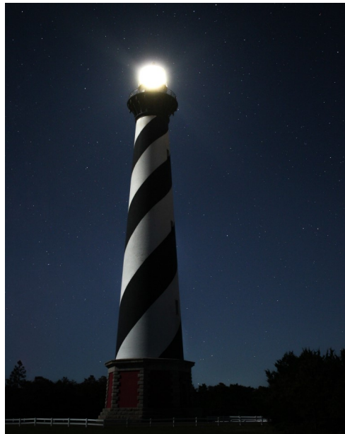
Cape Hatteras Lighthouse

visit to the Village of Manteo for lunch on your own and free time to visit the shops. It's a short walk to the Roanoke Marshes Lighthouse. Festival Park has much to offer. Take in the movie "Two Paths", which showcases the arrival of the first English colonists from the Native American perspective. Explore the Discovery Museum with hands-on North Carolina history displays. And, don't miss Elizabeth II, the replica sailing ship, and English settlement. Our next adventure will be to Kitty Hawk, N.C., to learn about Wilbur and Orville Wright's path to the first successful flight on Dec. 17, 1903. Dinner will be waterfront at Basnight's Lone Cedar Café. (B, D)